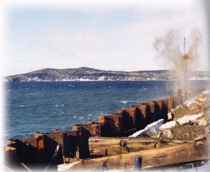
JZ 120 Shore Line Improvements Cold Formed Sheet Piles available in six different profiles to meet your specialized applications