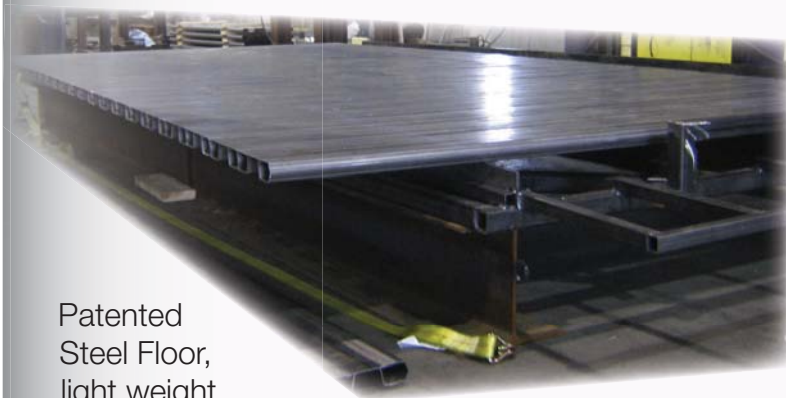
Patented Steel Floor, light weight, strength levels greater than 70,000 lbs per sq/ft depending on floor thickness