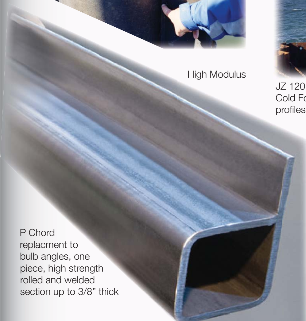
P Chord replacment to bulb angles, one piece, high strength rolled and welded section up to 3/8" thick