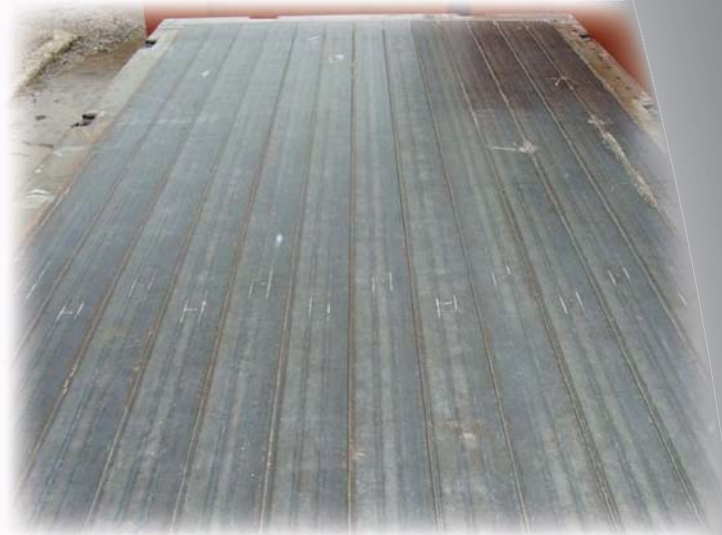
Patented Steel Floor Application: sectional barge, superior strength