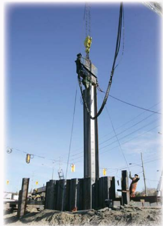
H-Bearing Piles Condo projects