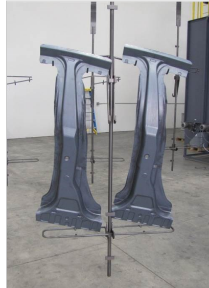
Finished shot blast pieces

Contact us for detailed information about our slitting and inspection capabilities