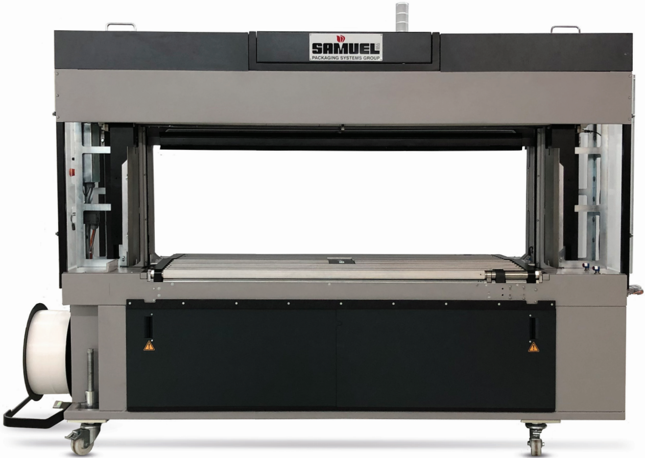
High speed corrugated strapper with integrated squaring system

Corrugated Bundler - Top Compression and 4-Sided Squaring