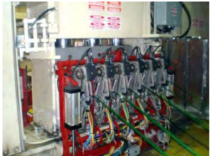
Bale Eject Side of Press