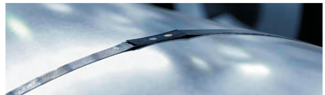
Our double welded joint (two weld locations) provides seal performances up to 90% of the breaking load of the strapping.