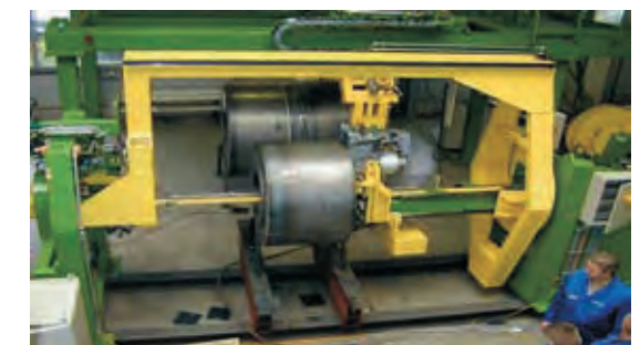
I.D. Strapping Eye Perpendicular