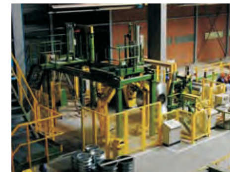
Circumferential Coil Strapping Eye Perpendicular