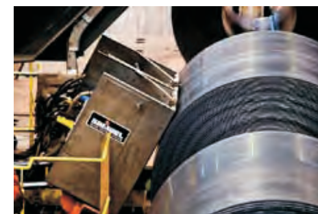
Circumferential Eye Parallel