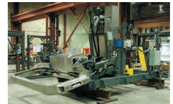
I.D. Strapping Eye Parallel